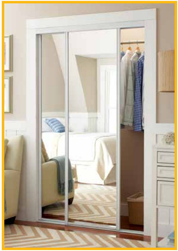
Pictured in a Gloss White finish with Duraflect® copper-free mirror