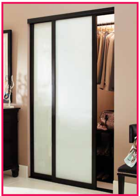
Pictured in an Espresso finish with Snow White back painted glass