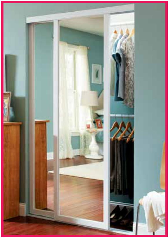
Pictured in a White (Gloss) finish with Duraflect® copper-free mirror