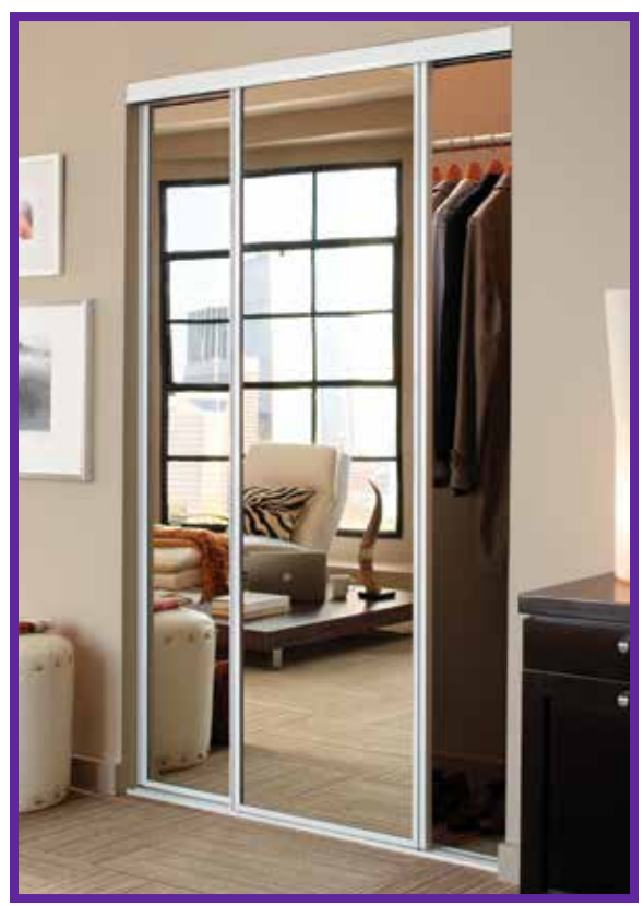
Pictured in a White finish with Duraflect® copper-free mirror