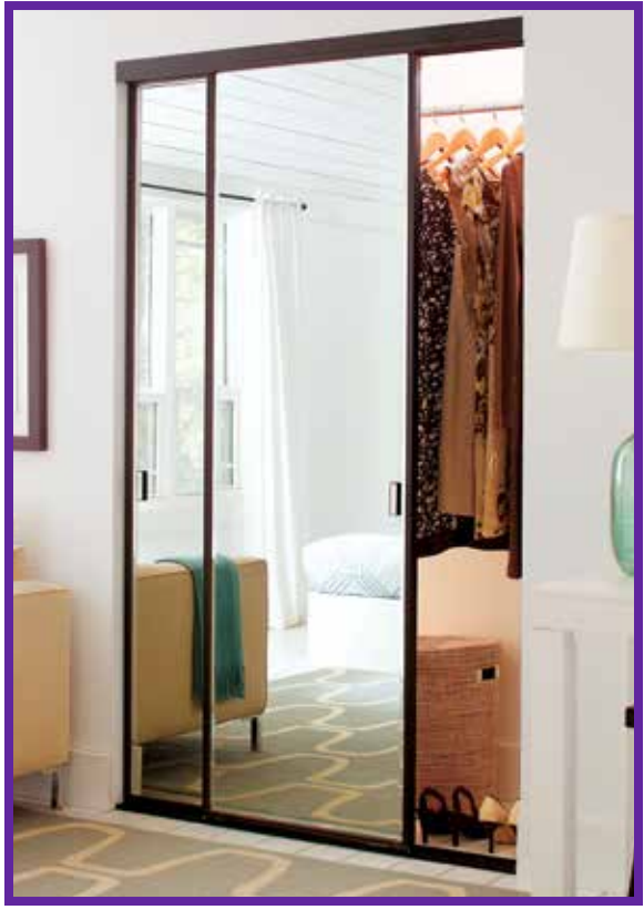
Pictured in a Bronze finish with Duraflect<sup>®</sup> copper-free mirror